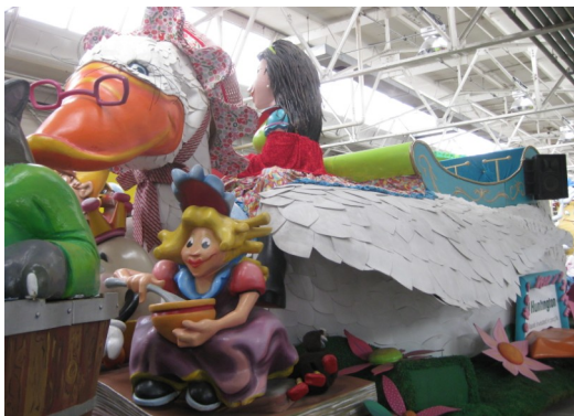
"Mother Goose" is the oldest float, one of the first to march down Woodward Avenue in 1924.