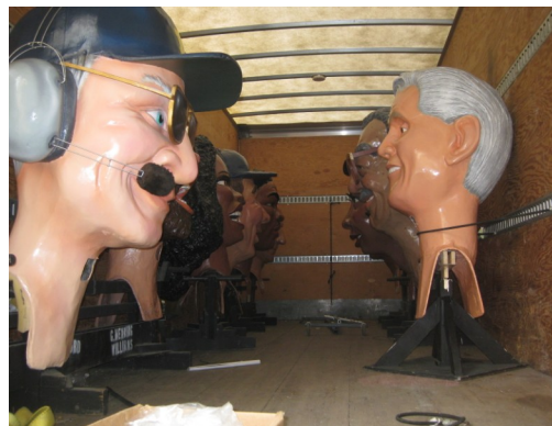
Parade Co. has the world's largest collect papier mache "celebrity heads."

ASQ Detroit Section sponsored a spectacular tour of the magical Parade Company Studio on Sat. April 2, 2011. It was a journey through their unique creative kingdom, a 110,000 sq. ft. storyland of floats. Approximately 60 attendees learned about the design & quality building processes and project management of the floats, as well as the entire planning process for the Parade, from the initial art rendering to frame to final product.